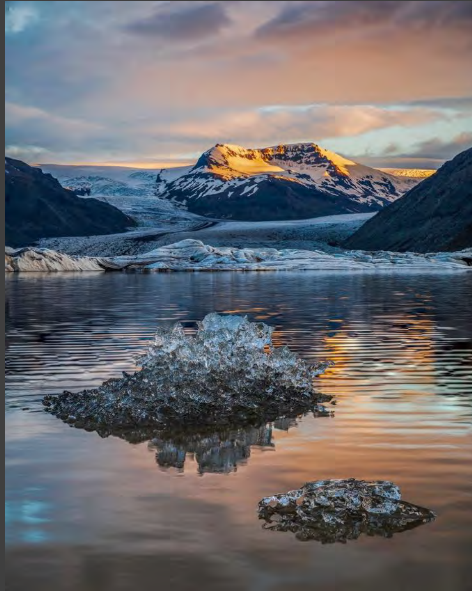
Glacial lagoon outside of Hofn (photo taken during a workshop)