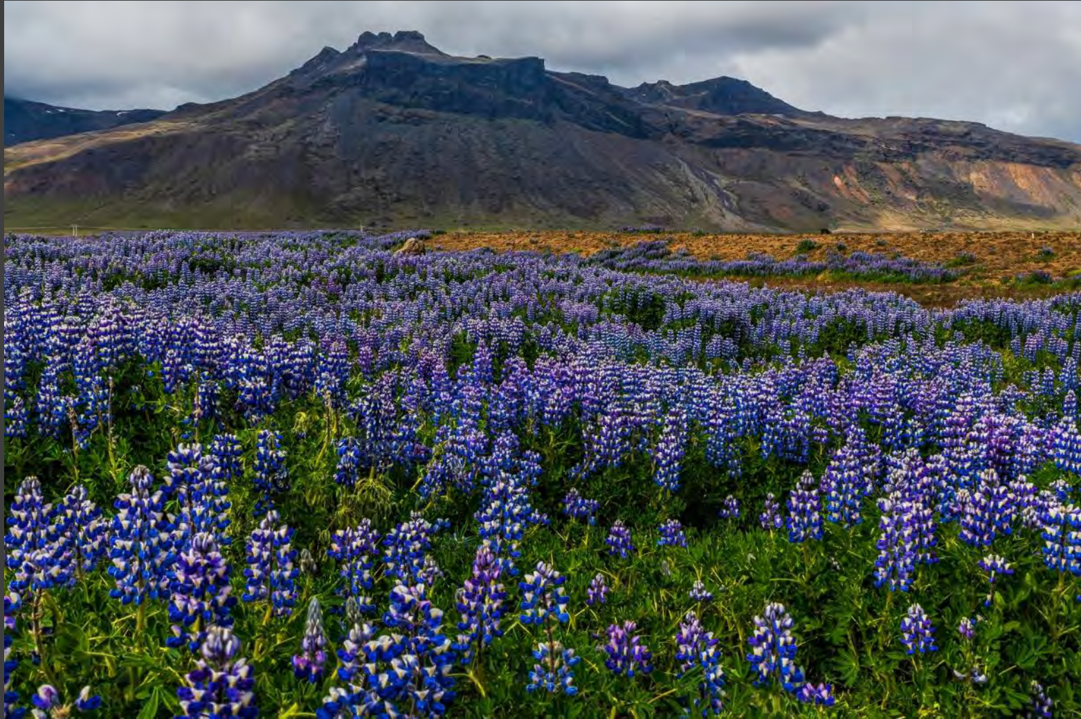
One of many fields of Lupine