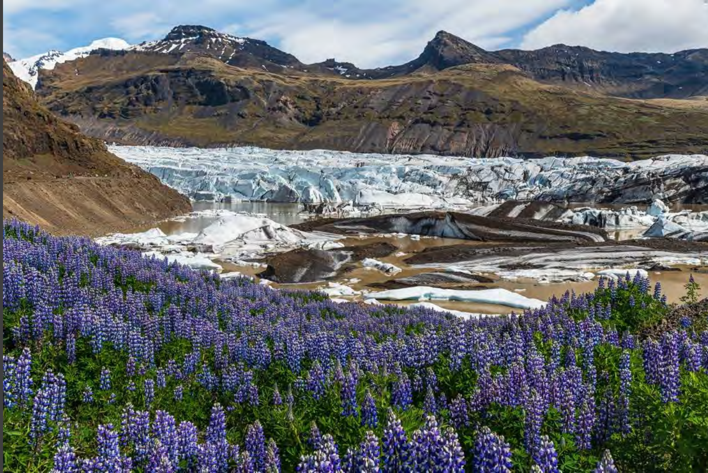
A glacier along the drive from Vik to Hofn