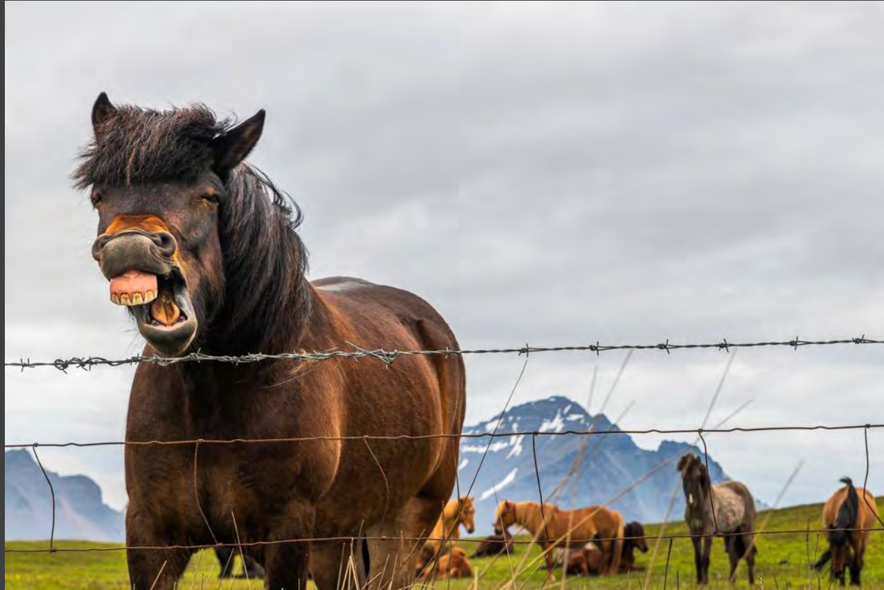
Icelandic horses with Vestrahorn Mountain in the background.