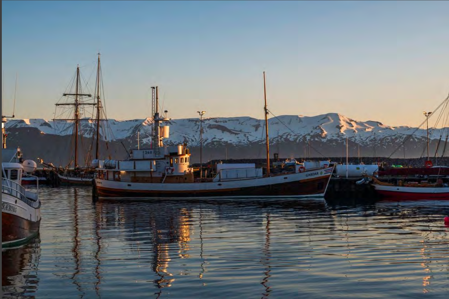
The northern port town of Husavik