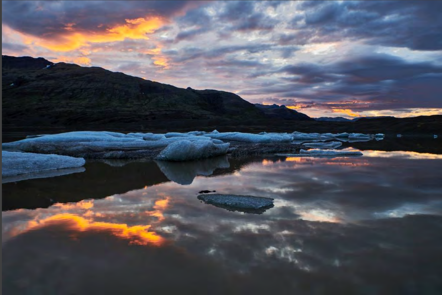
Glacial lagoon outside of Hofn (photo taken during a workshop)