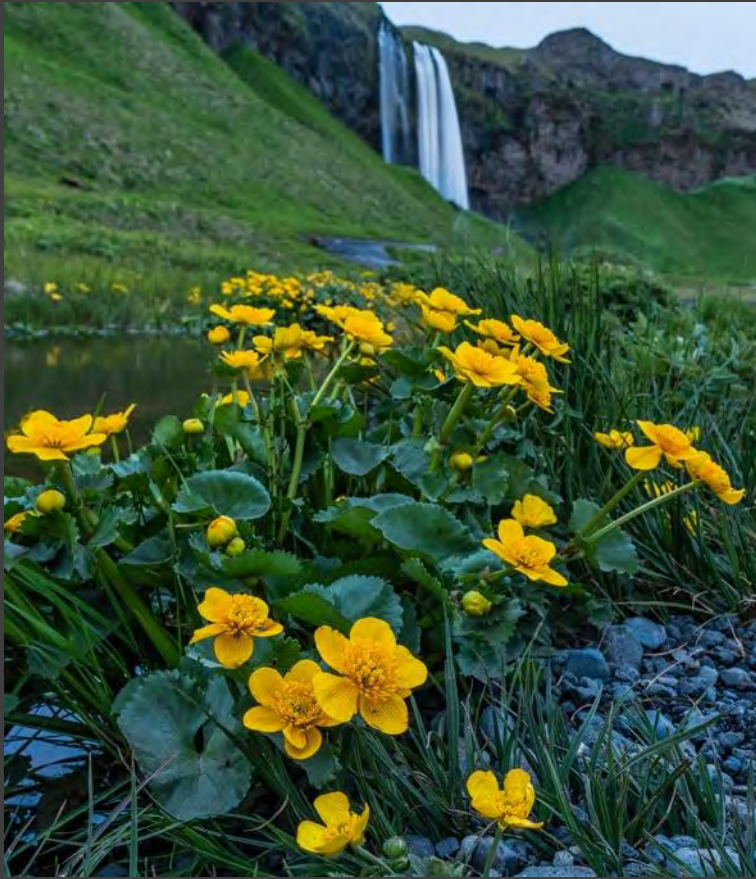
Pre-Sunrise at Seljalandsfoss