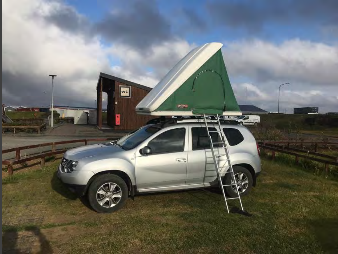
The campground at Grindavik near Keflavik Airport