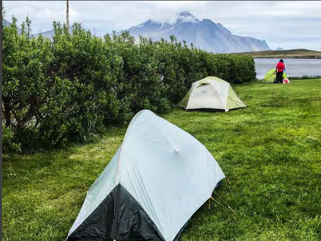
A campground near Hofn with a view of Vestrahorn Mountain