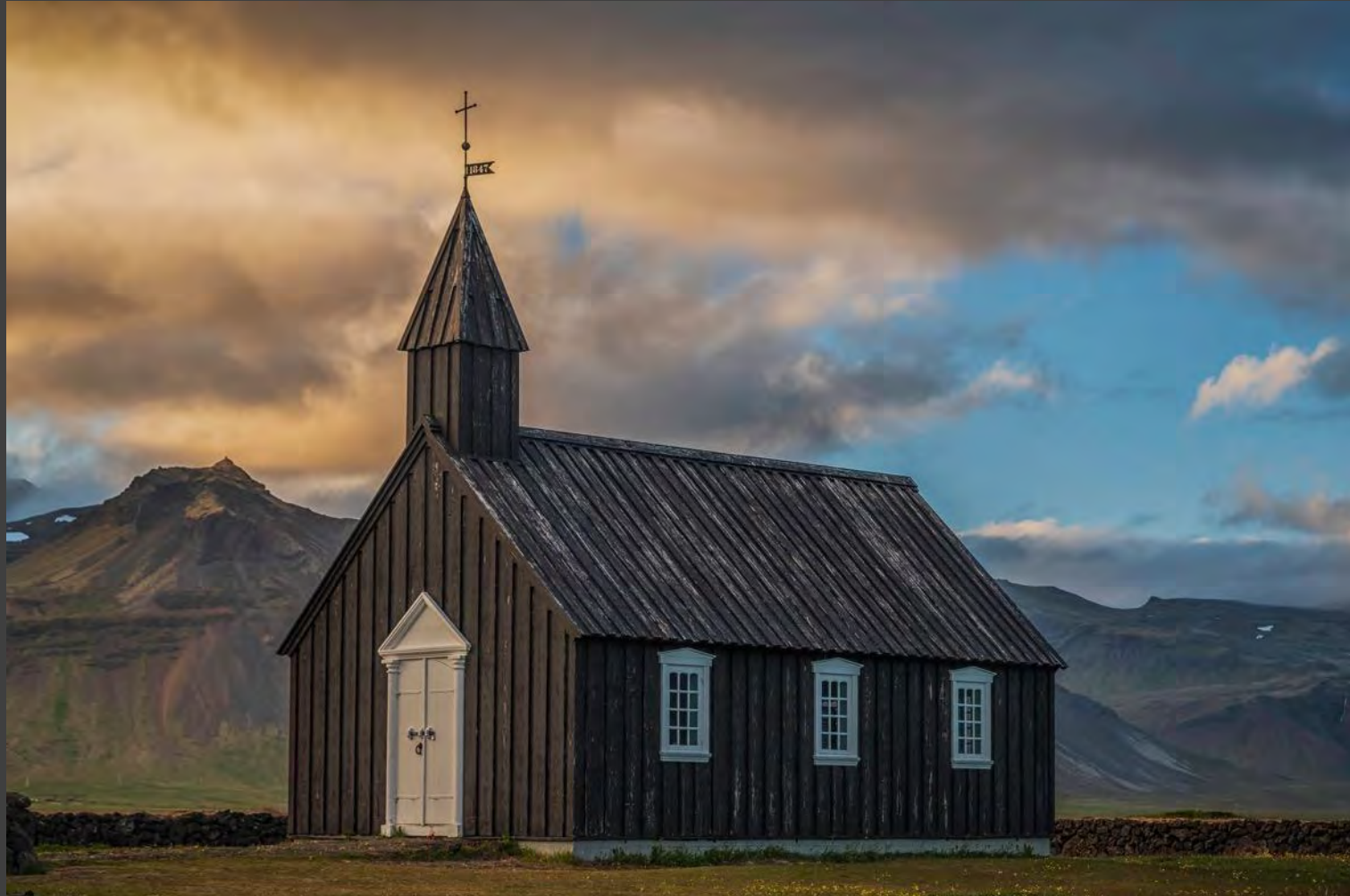
The Black Church at Budir