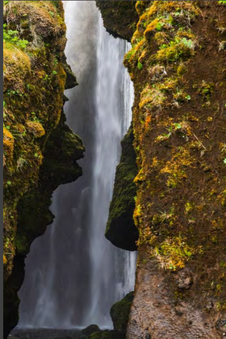
Gljúfurarfoss (30 yards from the tent)