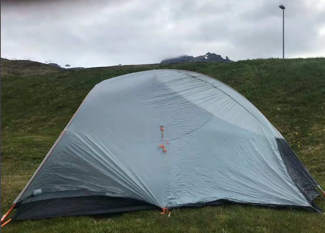
Tent Camping at Grundarfjörður Campground