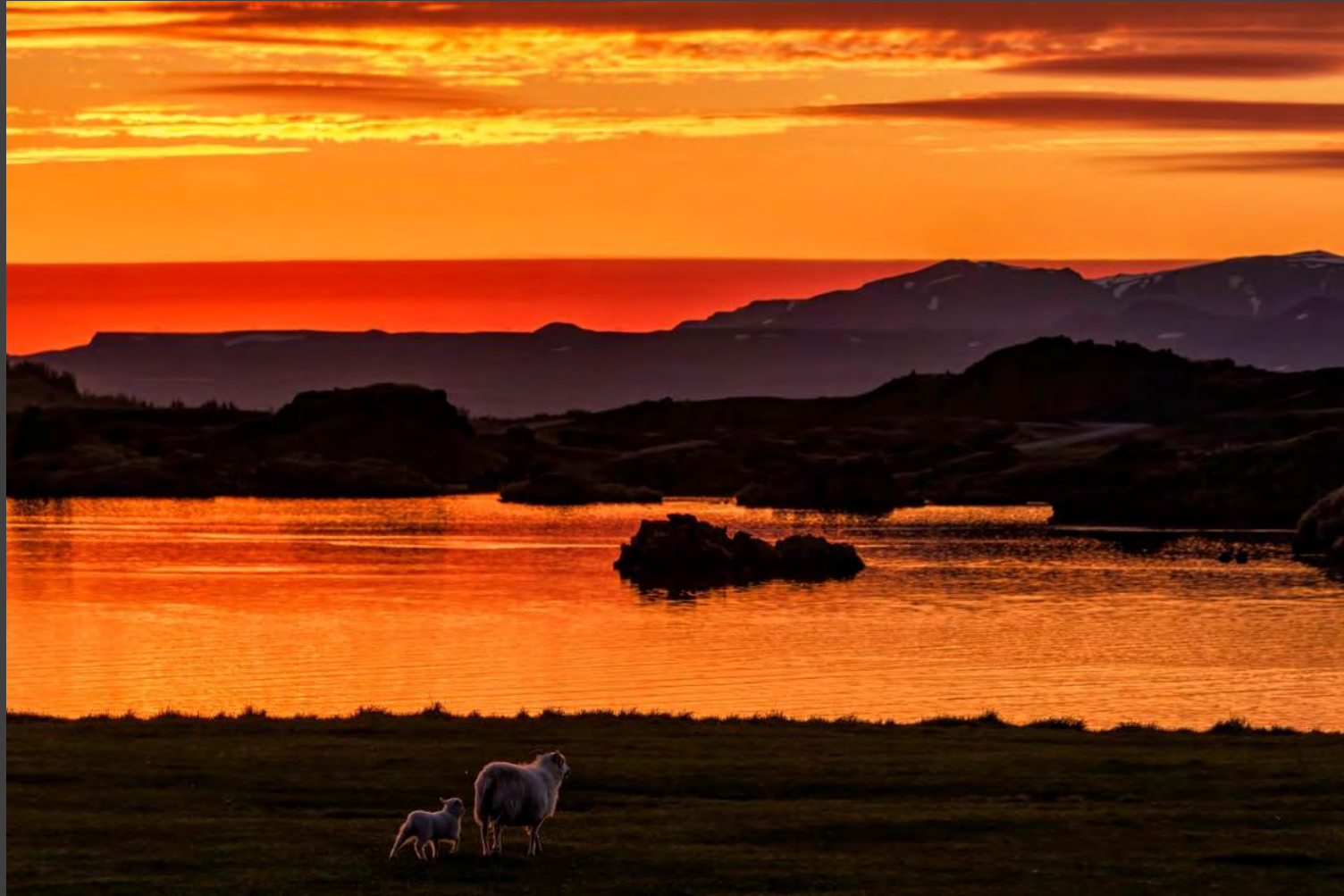
A pair of sheep taking in the midnight sunset at Lake Myvatn