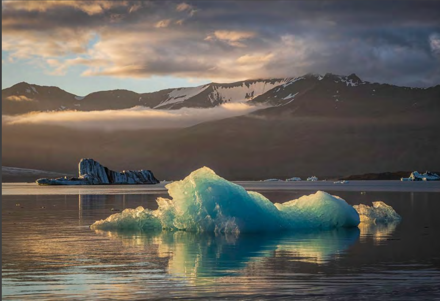
Sunset at Jokulsarlon Lagoon