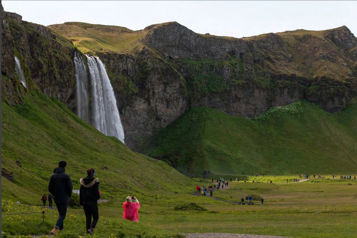
A photo from the Eystra Seljaland Campground