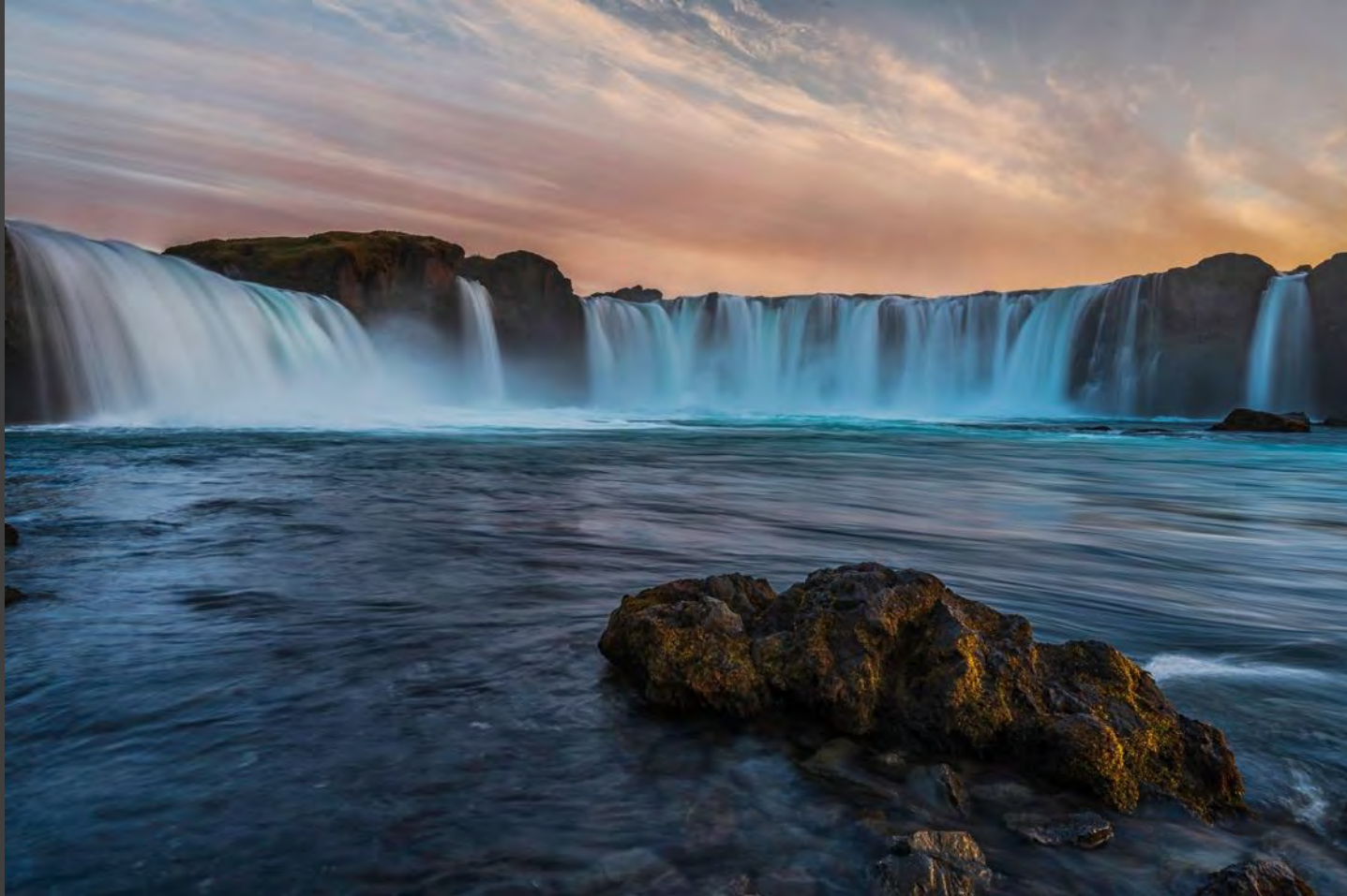
A late night at Godafoss