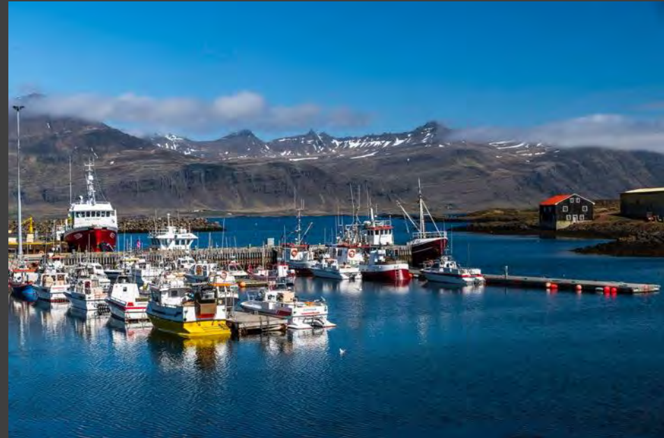
Scenes while driving along the Eastern Coast