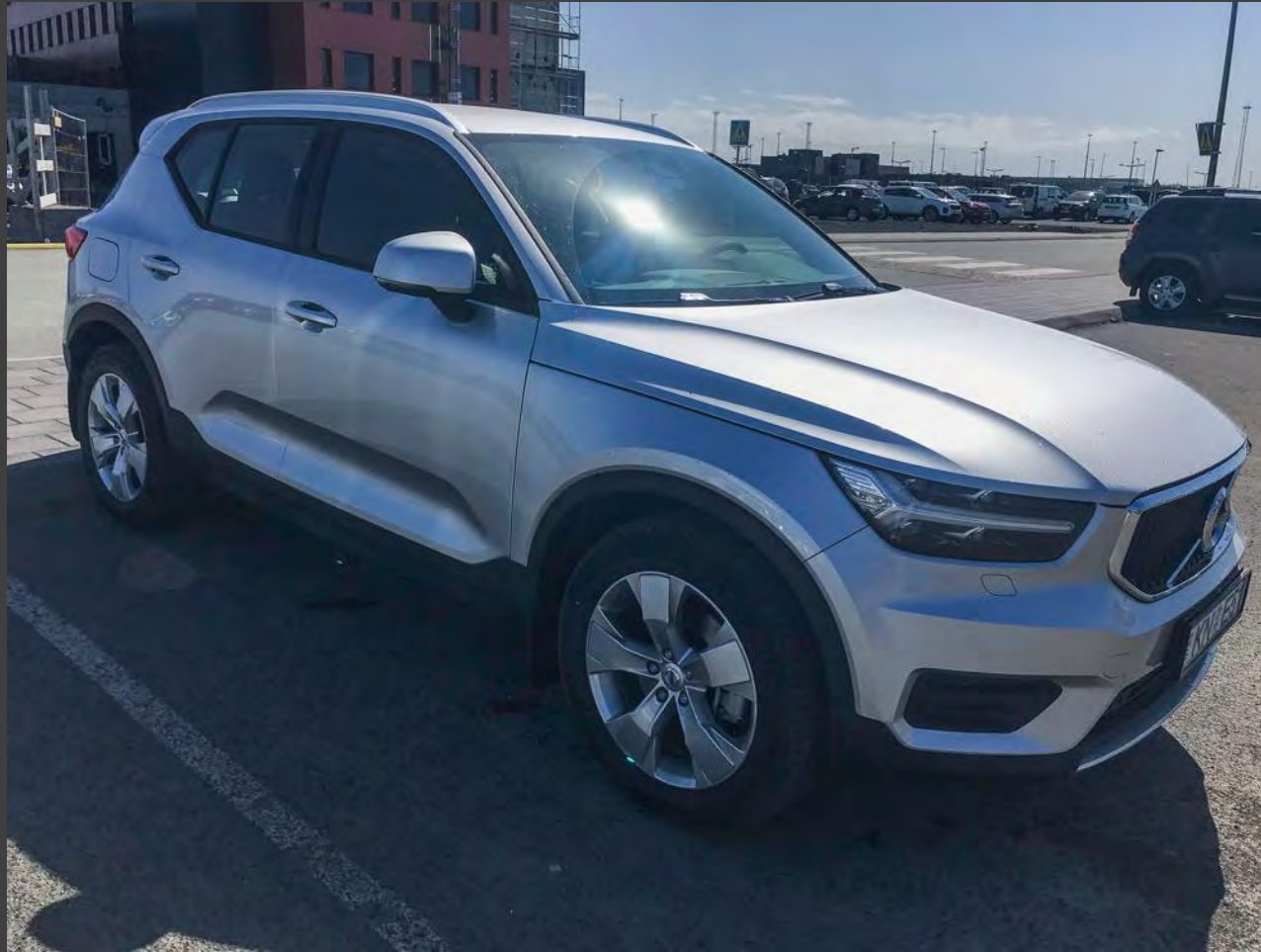
Volvo 4-Wheel Drive